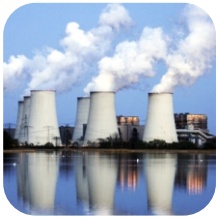
Nuclear Power Plant